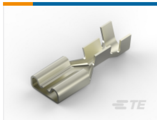
TE Part # 2238143-1 250 FASTON,REC.,22-18 AWG,NPST