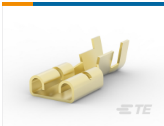
TE Part # 444335-1 250 FASTON REC 16-14 AWG BR