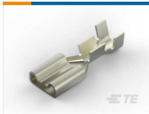
TE Part # 1742198-1 250 FASTON,REC.,18-14 AWG,NPST