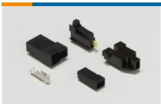
Magnet Wire Terminals(1)