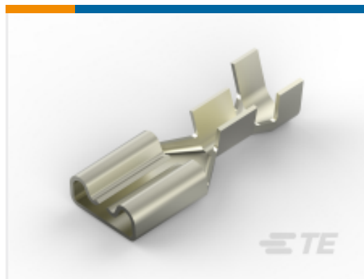
TE Part # 2238196-3 250 FASTON REC. 18-14AWG