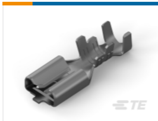
TE Part # 2238173-3 250 FASTON,REC.,22-12 AWG,TPBR